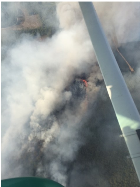
Photo: Covington County, AFC wildland firefighters work a 589 acre fire near Florala. Photo was taken by AFC pilot.

Alabama is a right to burn state, however, under drought conditions the State Forester holds the authority to restrict burn permits. To report a wildfire call the Alabama Forestry Commission or local Fire Department.